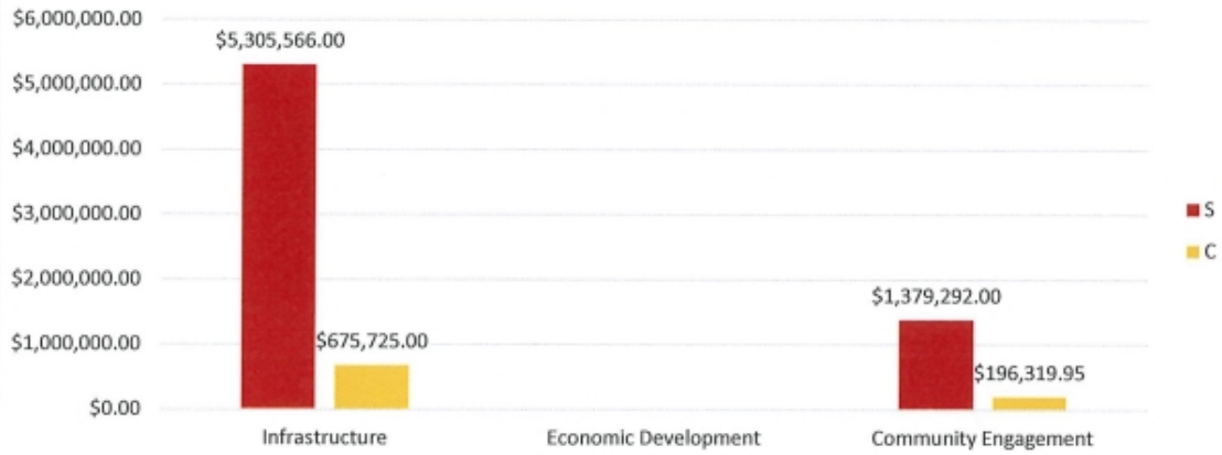
ACTIVITIES SUMMARY ($)

■ Community Engagement ■ Economic Development ■ Infrastructure